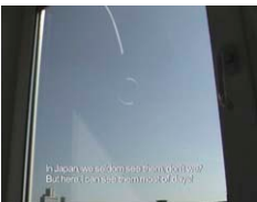
»Negai wo hiku / Drawing Wishes«

2011 ISCP- International Studio & Curatorial Program, NY, USA (scheduled) 2009 LIA- Leipzig International Art Programme, Leipzig, Germany 2009 Künstlerhäuser Worpswede, Worpswede, Germany 2007 Schleswig-Holsteinisches Künstlerhaus, Eckernförde 2006 Künstler Atelier AKKU Uster