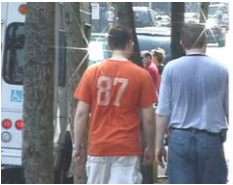
»Countdown in NYC«

2007&9 Akademi Schloss Solitude (discipline: Visual Arts), Stuttgart 2008 Japan Cultural Affairs Foundation, Japan 2003 Cittadellarte, UNIDEE International Residency Program, Italy